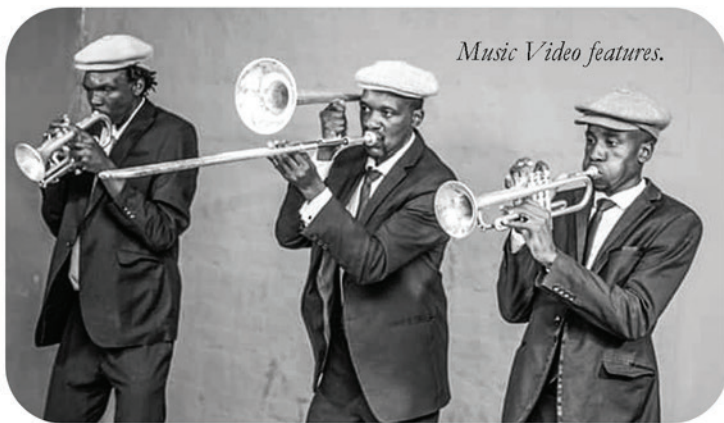
Music Video features.