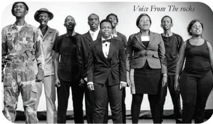
Voice From The rocks