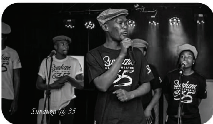
Sundusa @ 35