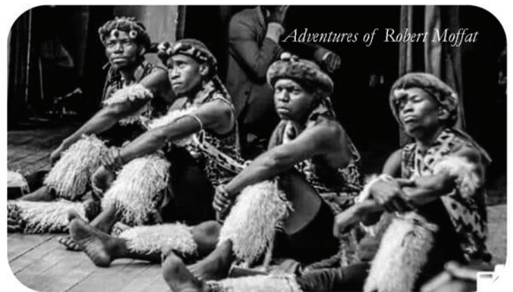
Adventures of Robert Moffat