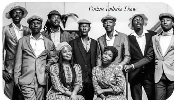
Online Imbube Show