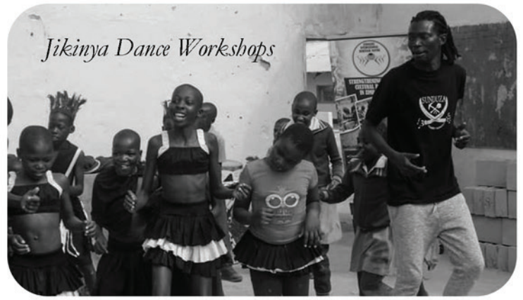
Jikinya Dance Workshops